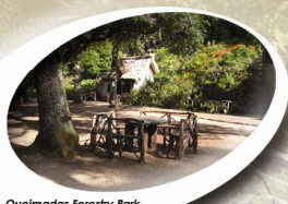
Queimadas Forestry Park