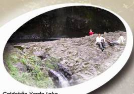
Caldeirão Verde Lake